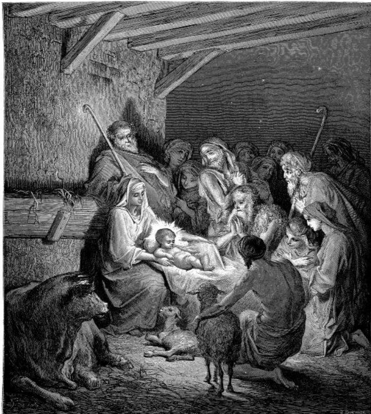
"The Nativity" by Gustave Doré

When we receive some good news, especially if it is unexpected, we just naturally want to share it with others – don't we? The shepherds certainly did. First of all the angel told the shepherds the good news. Then, because the news was so good the shepherds just could not keep it to themselves. They went out and told others all about it too. They did not have any formal evangelism training (as far as we know!), they just repeated what they had heard and seen. That is all that witnessing is really. We might not know the answers to deep theological questions, but we know what we have seen and heard. So, if we have just celebrated the good news of our saviour Jesus Christ we need to rejoice and share it with others. Perhaps that could be a New Year resolution?